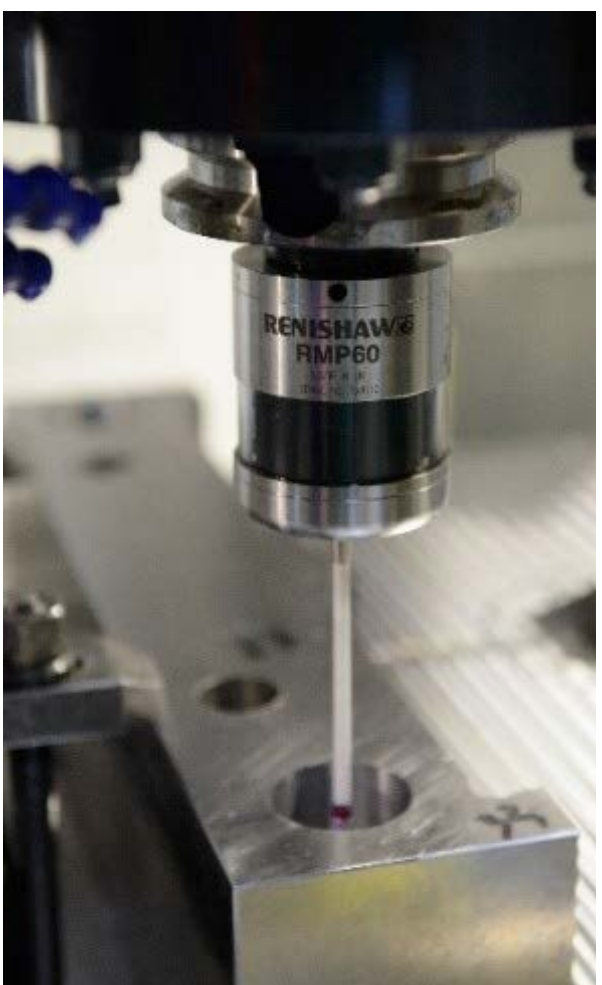
RMP60 spindle probe measuring a mould base

In response to the changing market dynamics and its new business opportunities, GM Enterprise needed to increase its production capacity quickly while simultaneously reducing the chance of human error and raising production throughput.