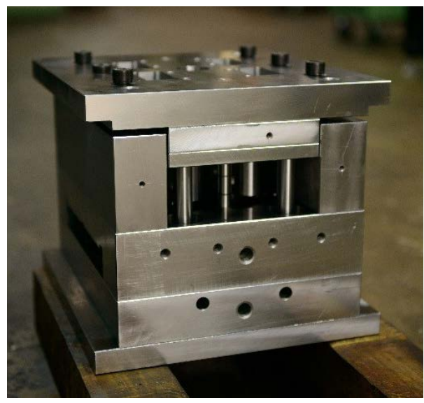
A mould base from GM Enterprise

GM Enterprise's investment in Renishaw equipment and the increased production capability it has delivered has been warmly received by both customers and staff. The company is now producing around 2,500 mould bases every year and has placed an order for a further three CNC machine tools, each specified with a Renishaw GUI and tool setting probes.