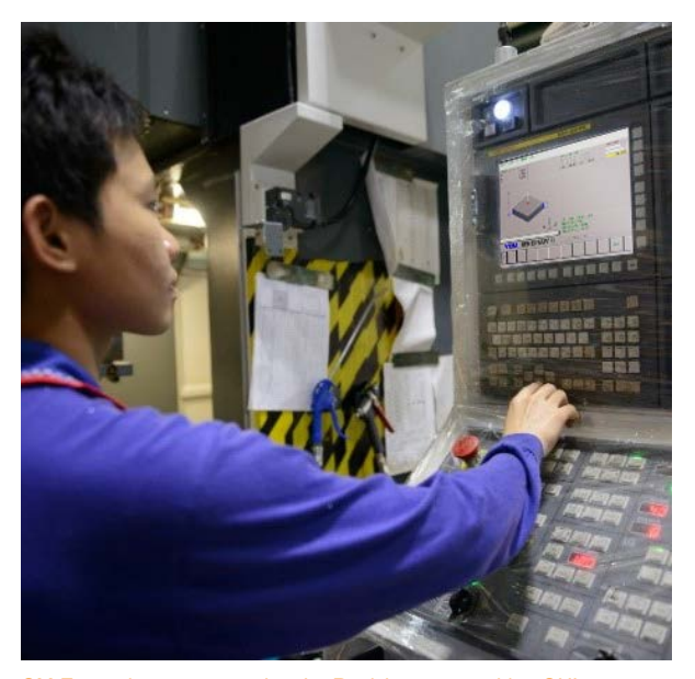
GM Enterprise operator using the Renishaw on-machine GUI