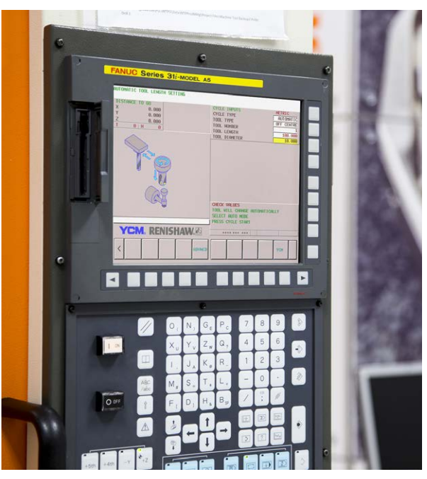
Renishaw GUI on a Fanuc controller

GM Enterprise's first radio transmission tool setters, the RTS probes added greater installation flexibility and unrestricted machine movement, with the probes providing both broken tool detection and rapid measurement of tool length and diameter at \pm 1~\mu m repeatability.