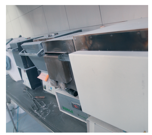
Old technology used in the casting method