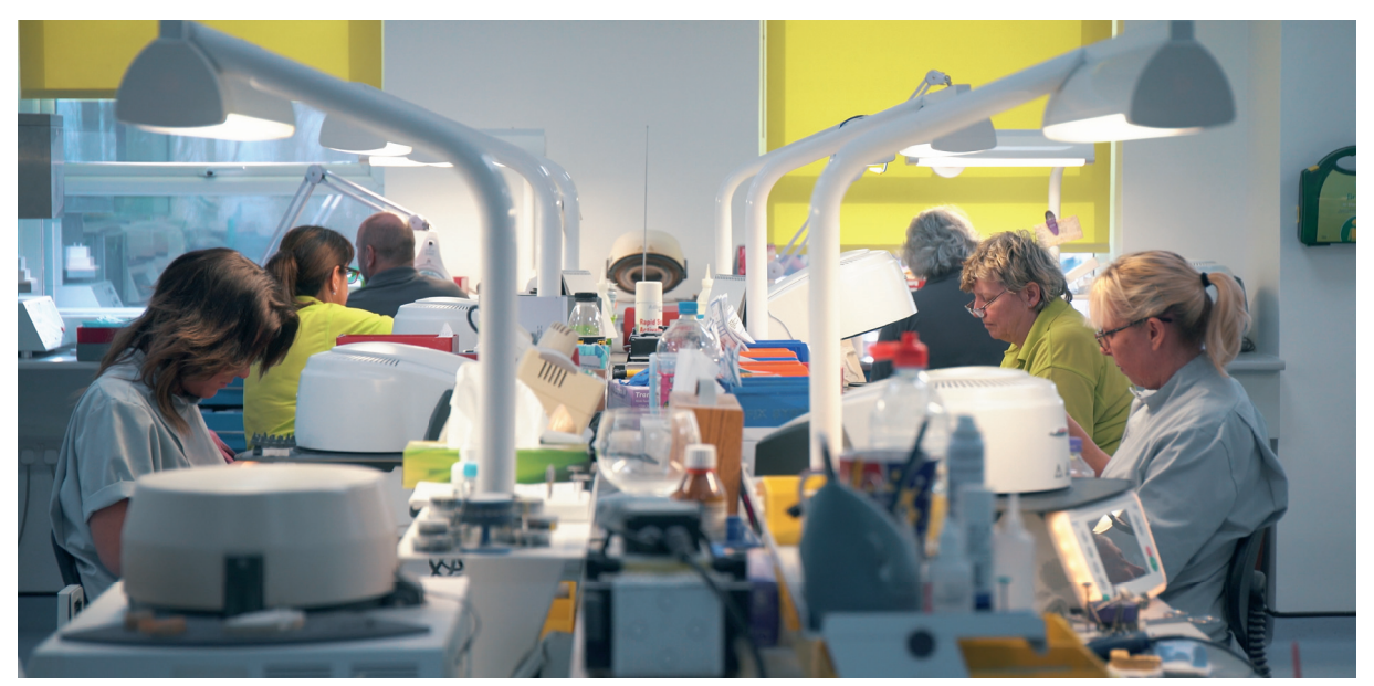
Finishing process at Swift