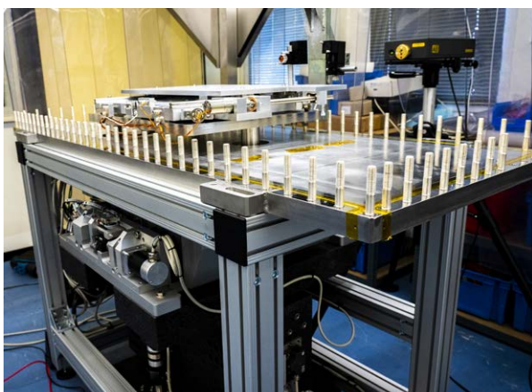
Mirror platform with both in-air and in-vacuum motion stages

Prior to delivery to the customer, each IRELEC mirror system is calibrated and qualified using Renishaw's laser calibration system. Renishaw's XL-80 laser system which has superseded the ML10 laser, is a fast, accurate and extremely portable interferometric measurement system with a linear accuracy of \pm 0.5 ppm.